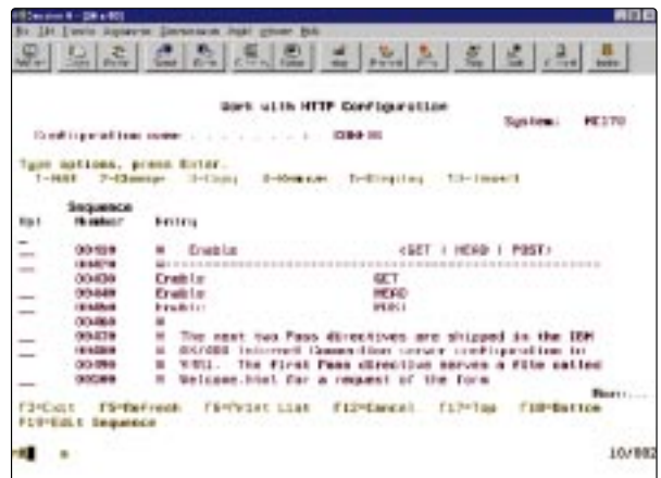
Figure 1: Work with HTTP Configuration (WRKHTTPCFG) maintains directives contained in the configuration object.

If you are programming in C, be sure to include the qsyvldl.h header file, as in this directive: